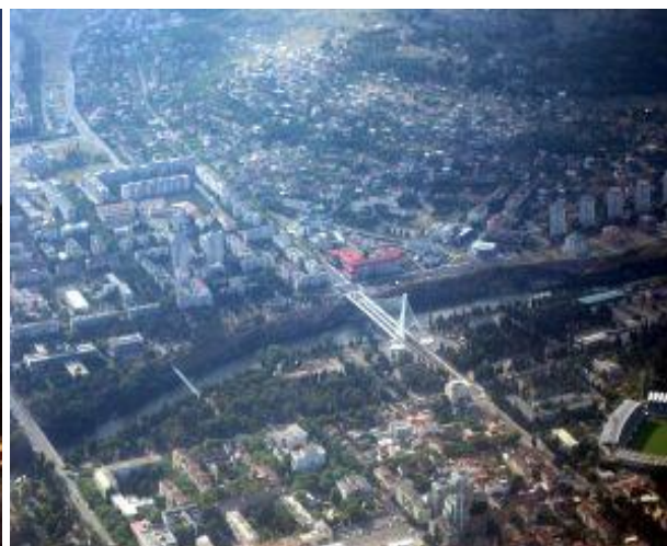
Aerial view of Podgorica